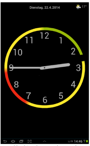
Consumption shift feedback Unobtrusive passive mode